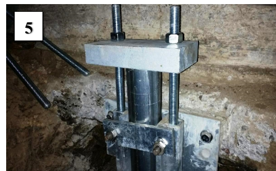
Photo 5 shows a detail of the finished pier bracket installation prior to backfill. The ECP Steel Pier™ Assembly is easily adjusted should geologic conditions change.

Photograph 4 shows a technician using hydraulics to install the steel pier pipe into the soil. Each section of pier pipe is 3-1/2 feet long and the process continues until the pier encounters rock or a suitably firm bearing stratum.